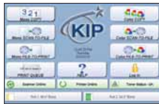
KIP 9900 Series touchscreen interface

The integrated KIP touchscreen operator panel provides the ultimate in copy, scan & print technology right at your fingertips. KIP systems eliminate the need for additional PC hardware by printing documents from removable media such as standard USB drives, network drives, & scan mailboxes directly from the touchscreen interface.