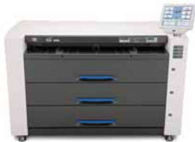
KIP 9900 Network Printing System

Documents containing lines, text, renderings, grayscales and aerial photos are easily scanned in to a variety of formats including single and multi-page PDF and DWF files.