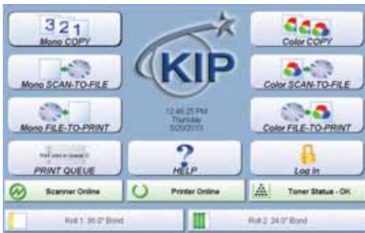
Perform all scan, copy and print functions using the integrated touchscreen user interface

Color scanning, copying and printing is accomplished directly from the KIP touch screen display with preset selections for image quality, file naming, copy or print count, image sizing, and rotation. KIP delivers world class color scanning, copying and printing directly to industry standard inkjet printers that have been fully integrated with KIP software.