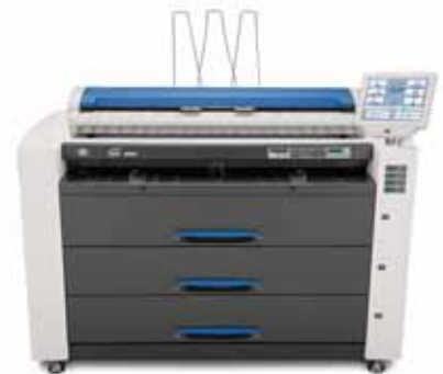
KIP 9900 Multifunction System with KIP 600A Scanner