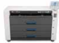
KIP 9900 Network Print System