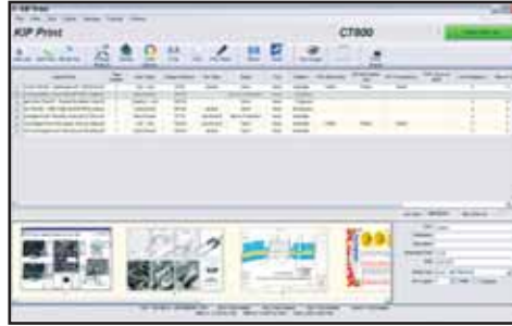
Intuitive new ribbon style interface

KIP Print network printing software is an easy to use application designed to provide operators with a fast and accurate means of producing high quality print sets from all types of wide format digital files. An intuitive ribbon style interface with an emphasis on job building; featuring column browsing, color thumbnail previews and total preflight control. Color and B&W documents are efficiently selected for printing in collated sets with the ability to designate custom output preferences before print submission.