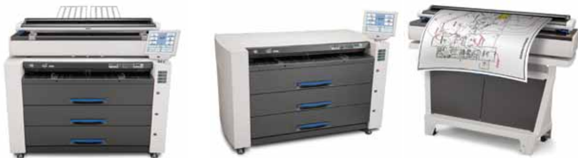
KIP 9900 Multifunction Production System with 2300 Scanner in single and dual footprints