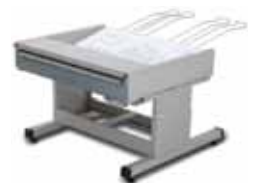
KIP 1200 Stacker Stacks 1000 A-E size prints