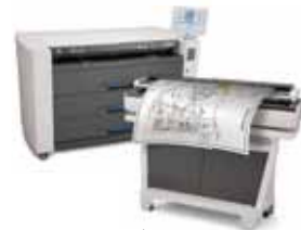
KIP 9900 Production Systems with KIP 2300 Scanner in Single & Dual footprint