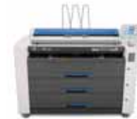
KIP 9900 Multifunction System with KIP 600A Scanner