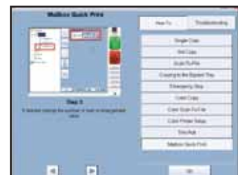
On demand illustrated operator guides

The KIP System Guide is available at the KIP 9900 operator panel and downloadable via KIP PrintNET to assist operators by providing a quick reference resource for all KIP application features.