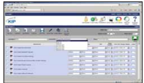
Web based, browser independent

KIP PrintNET is a true web-based print production tool that delivers powerful color file viewing & printing, job queue management and administration features without the need to install any software applications on network computers. Users may select and send single or multiple files to KIP systems, complete with image adjustments such as scaling, stamping and color management! In addition, KIP PrintNET generates Email reports detailing system usage on demand or at designated intervals.